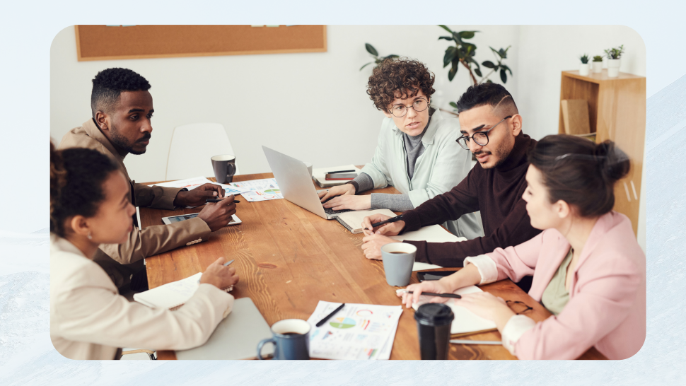
Potential to Extend Discussion

Each person is given a specific amount of time to speak, and the discussion has a set time limit.